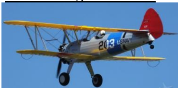
Boeing Stearman E75 (ZK-XAF) at Tauranga